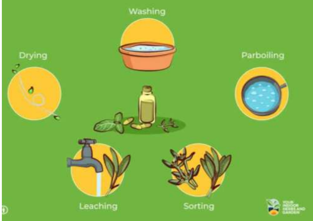
Figure-03: 5 Primary Steps in Herbal Processing