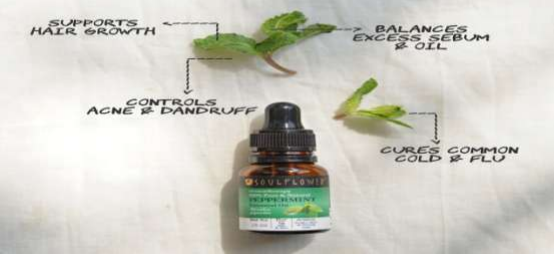
Figure-04: Benefit of Peppermint